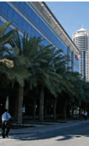
CNN Building in Dubai Media City.

Creativity City is the latest project under the administration of the recently formed Fujairah Culture and Media Authority (FCMA). It will be operated and administered by Fujairah Media.