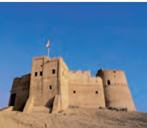
Fujairah Fort has been recently restored.

Over on the East Coast, at Kalba, an enclave of Sharjah, the former house of the local ruling family has been carefully restored, as has a rectangular Islamic fort nearby, while work is also under way on the restoration of a larger fortress at Khor Kalba, which may rest on the site of a fort build by the Portuguese in the fifteenth century AD.