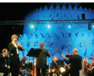
Al Ain Classical Music Festival.

Al Ain Classical Music Festival is a yearly event featuring classical music concerts of a high artistic standard.