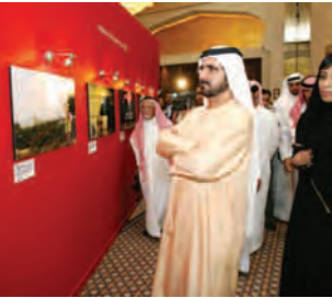
HH Sheikh Mohammed bin Rashid Al Maktoum at the Arab Media Forum 2007.

The 2007 Arab Journalism Awards were presented to Arab media personalities and publications on the concluding day of the Arab Media Forum.