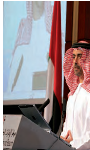
Lt. General Sheikh Saif bin Zayed Al Nahyan, Minister of Interior, addressing the Annual Conference of the Emirates Centre for Strategic Studies and Research.

Emirates Heritage Club helps to preserve traditional sports such as camel racing, boat racing and falconry.