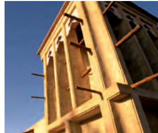
Traditional windtowers provided natural cooling.

The beautifully renovated Ra's al-Khaimah Fort behind the Police Headquarters on Al Hosn Road in the old town, was the residence of the ruling family until the early 1960s.